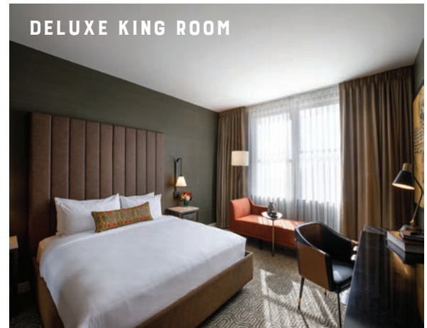
DELUXE KING ROOM